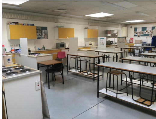
Home Economics room