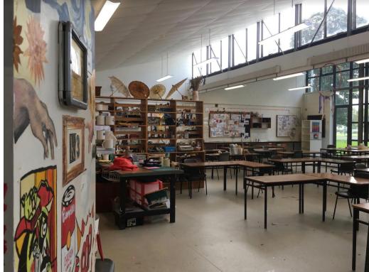
Visual Art classroom

Here are some examples of our practical classrooms.